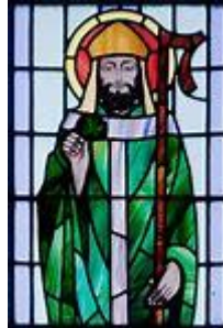
Happy St. Patrick's Day! (March 17, 2022)

It is time to have your financial checkup. Just like a car inspection, it is important to review your financial security yearly. Schedule your review today by calling 724-728-6820. We offer in house, telephone, or zoom review meetings.